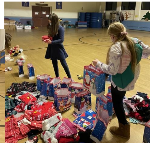
This week, our Girl Scout Troop 59010 put together over 30 Christmas gift bags filled with pajamas, mittens, hats, and stuffed animals to donate to children of Monadnock Family Youth Service!