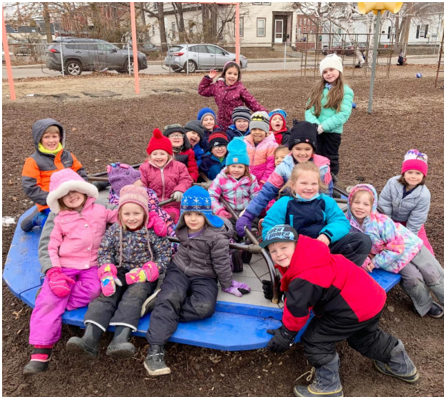
Fun on the playground with the Preschool and Kindergarten!

DEPOSIT – Drop your School Dollars in the SJRS Hannaford Helps Schools collection tower in-store, or send them in to the SJRS Main Office with your child.