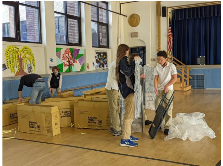
All of the 8 th graders were a huge help yesterday, unpacking and organizing our new navy blue folding chairs to be used throughout our buildings!