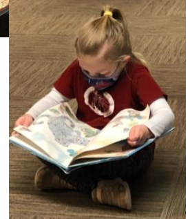
Preschool friends waiting in the Main Office.