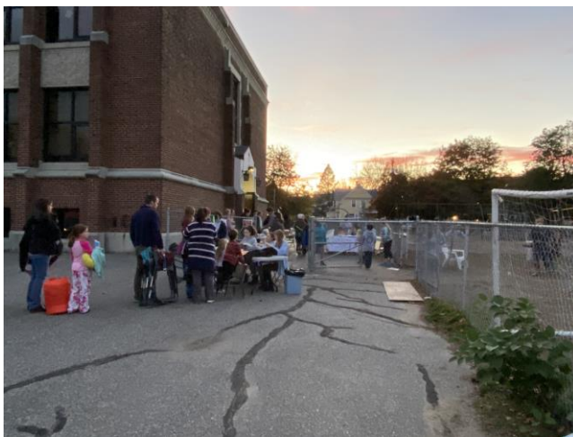
Our Movie Night last week was a blast for everyone! Thank you to the SJRS and OLMA Student Councils for organizing this event!