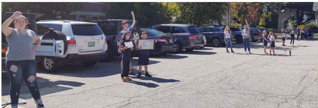
On Monday, we went on a space walk! The Mercy Academy Earth & Space class along with the SJRS 3rd grade shared their joint solar system scale model project with everyone. Mercy's Algebra I class also used this project to discuss scale and shared a model as well. The students presented their scale models and interesting facts about planets, moons, the Asteroid belt, and the Kuiper belt. We walked the solar system from the sun all the way to the Kuiper belt — 4.4 billion miles!