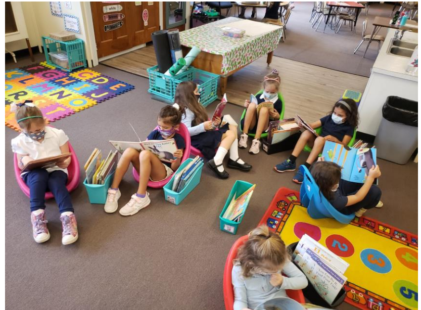
Reading time in the Kindergarten!

One last reminder: please be sure to complete the NEASC accreditation family survey by tomorrow, October 15. CLICK HERE for the survey